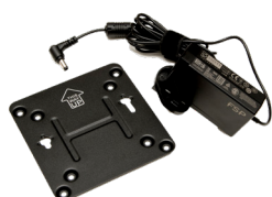
Supplied complete with VESA mount bracket and PSU