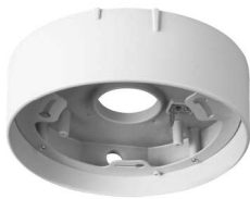
BJC06 Surface Mount Bracket