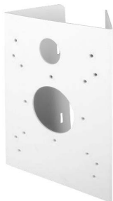
BP01 Pole Mount Adaptor

Note : To install WV-20M4-28V8, one of the above three brackets is required.