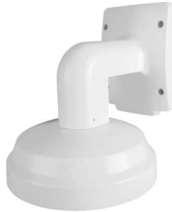
BW15 Wall Mount Bracket