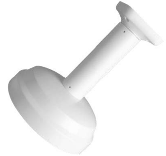
BC15 Drop Mount Bracket

Note : To install WV-10M2-27V13, one of the above three brackets is required.