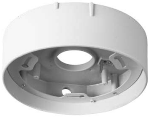
BJC06 Surface Mount Bracket