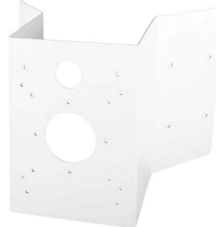
BCO01 Corner Mount Adaptor