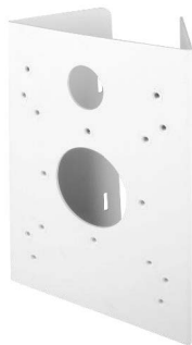
BP01 Pole Mount Adaptor

Note : To install WV-10M2-27V13, one of the above three brackets is required.