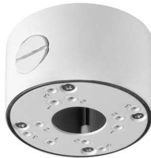
BJC07 Junction Box